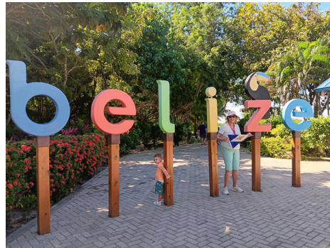
NYCP Members on the 2026 FCA Cruise